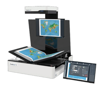
Bookeye BE5 V1A

The library requires the acquisition of a Bookeye BE5 V1A scanning device (capable of scanning documents larger than A1 size: 635 \times 914 mm) to digitize its collection and other materials, including old books.